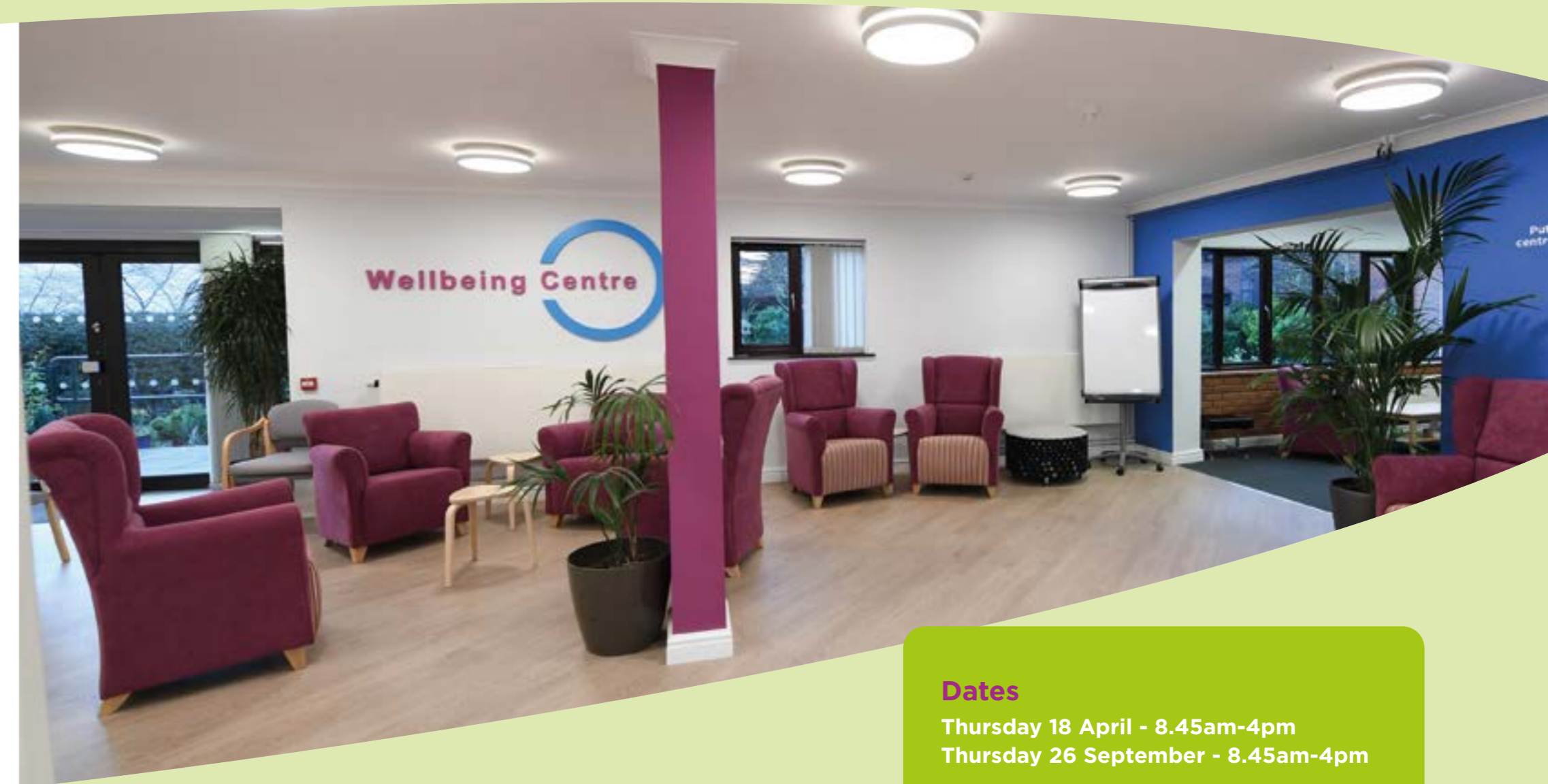
Wellbeing Centre, Keech Hospice Care.